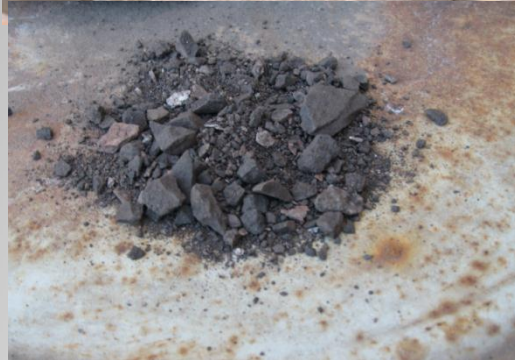
CRUSHED RESOURCE MATERIAL