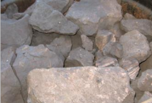
AS-RECEIVED RESOURCE MATERIAL